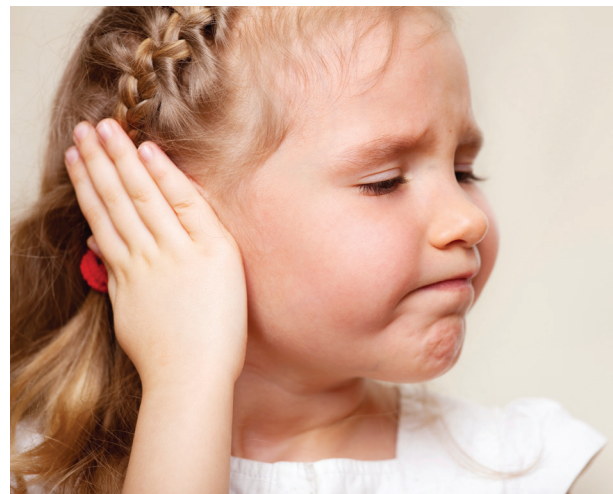
Child with ear infection